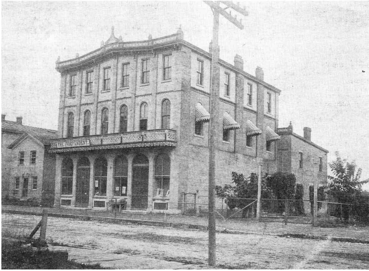
In 1892 a third floor was added to the Temple House for an additional $500.