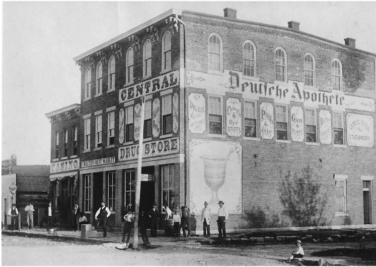
Walter Building (Central Drug Store) and Casino Tavern.

The lot to the east of the Walter Building is now empty. But, at one time, the Casino Tavern (1310) stood here. While it appears to be attached to the Walter Building, it was a free-standing structure.